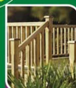
Decking & Landscaping

Open 7 days. Brockley Combe, Backwell, Bristol BS48 3DF