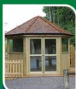
Sheds & Buildings